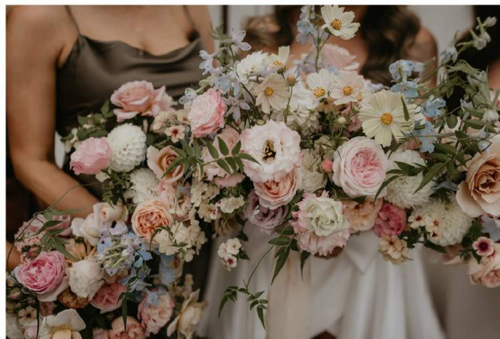
AMELIA & MATT | MASSAROS, YARRA VALLEY | PINTEREST INSPIRED AESTHETIC PHOTOGRAPHER: HAD TO BE YOU WEDDINGS