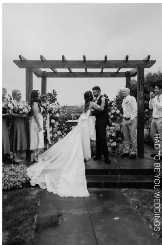
HAD TO BE YOU WEDDINGS