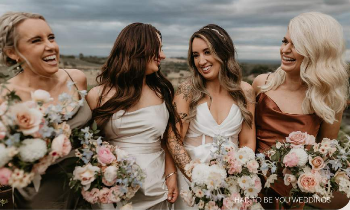
HAD TO BE YOU WEDDINGS