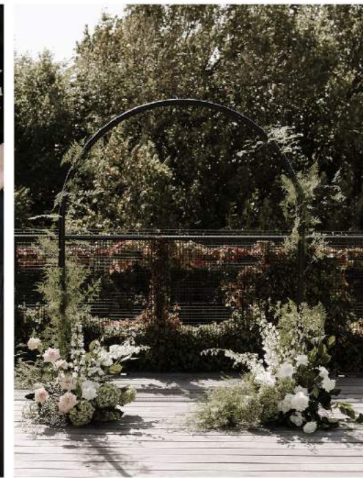
AIMEE & NICK | PRINCE DECK | PURE ELEGANCE