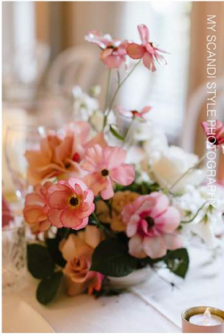
MY SCANDI STYLE PHOTOGRAPHY