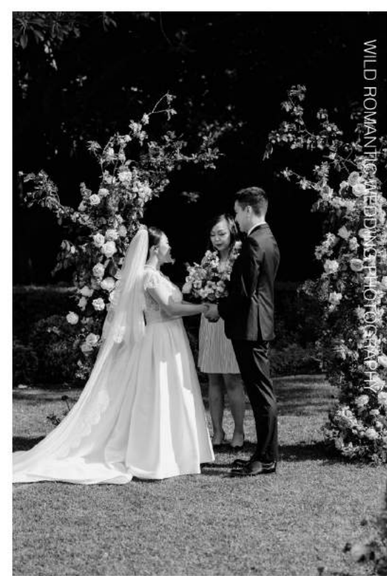
WILD ROMANTIC WEDDING PHOTOGRAPHY