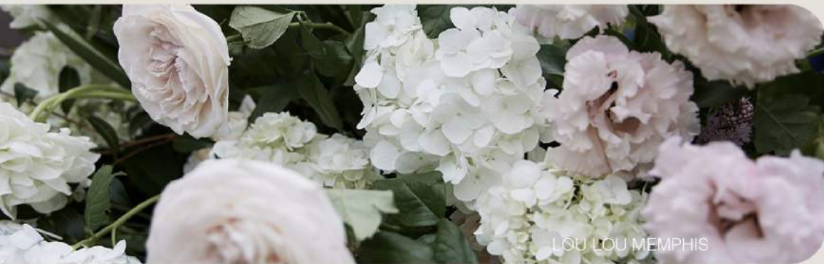
LOU LOU MEMPHIS